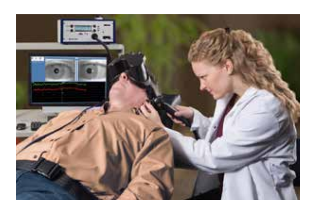
Caloric Air Fx Testing

Parts of the ENG/VNG test battery evaluate the movement of the eyes as they follow different visual targets. Other parts of the ENG/VNG observe eye movements as the head is placed in different positions. A third component of the ENG/VNG is called the caloric test , which uses changes in temperature within the ear canal to stimulate part of the vestibular system. Air or water may be used to modulate the ear canal temperature, which may be warmer or cooler than body temperature. This test should provoke jerking eye movements ( nystagmus ) for a short time.