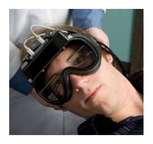
VNG Binocular Goggles

Electronystagmography (ENG) refers to a group of tests or test battery, and uses small electrodes placed over the skin around the eyes during testing. Videonystagmography (VNG) refers to the same test battery run using goggles with video cameras to monitor the eyes. Both the video cameras and the electrodes can measure eye movements to evaluate signs of vestibular dysfunction or neurological problems. Generally these tests are performed in a