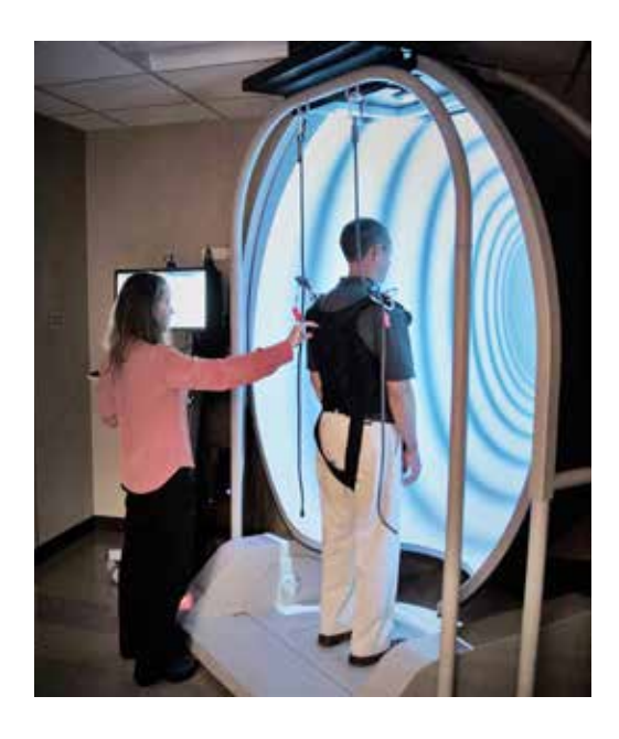
CDP Testing

CDP tests involve standing still on a platform. The platform may be still or able to shift, or a visual target may be still or able to move during testing. Pressure gauges under the platform record shifts in body weight (body sway) as the person being tested maintains balance under different conditions. A safety harness is worn as a precaution, should the patient lose their balance.