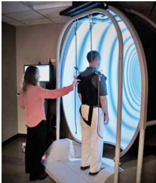
CDP Testing

CDP tests involve standing still on a platform. The platform may be still or able to shift, or a visual target may be still or able to move during testing. Pressure gauges under the platform record shifts in body weight (body sway) as the person being tested maintains balance under different conditions. A safety harness is worn as a precaution, should the patient lose their balance.