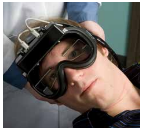
VNG Binocular Goggles

Electronystagmography (ENG) refers to a group of tests or test battery, and uses small electrodes placed over the skin around the eyes during testing. Videonystagmography (VNG) refers to the same test battery run using goggles with video cameras to monitor the eyes. Both the video cameras and the electrodes can measure eye movements to evaluate signs of vestibular dysfunction or neurological problems. Generally these tests are performed in a