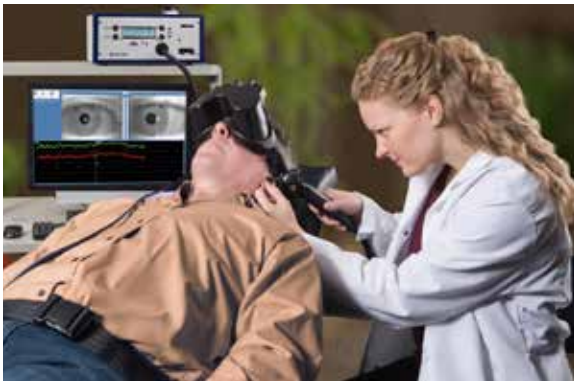
Caloric Air Fx Testing

Parts of the ENG/VNG test battery evaluate the movement of the eyes as they follow different visual targets. Other parts of the ENG/VNG observe eye movements as the head is placed in different positions. A third component of the ENG/VNG is called the caloric test , which uses changes in temperature within the ear canal to stimulate part of the vestibular system. Air or water may be used to modulate the ear canal temperature, which may be warmer or cooler than body temperature. This test should provoke jerking eye movements ( nystagmus ) for a short time.