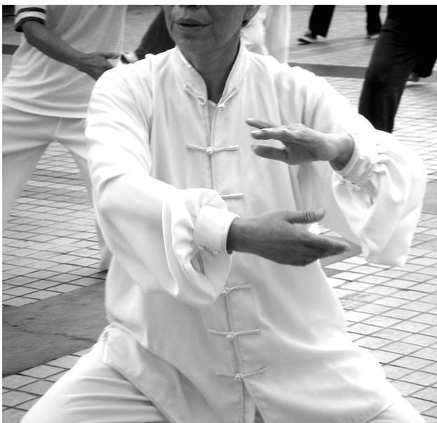
Figure 2. The hold a ball form is the basis for many of the movements in the "Tai Chi: Moving for Better Balance" program.